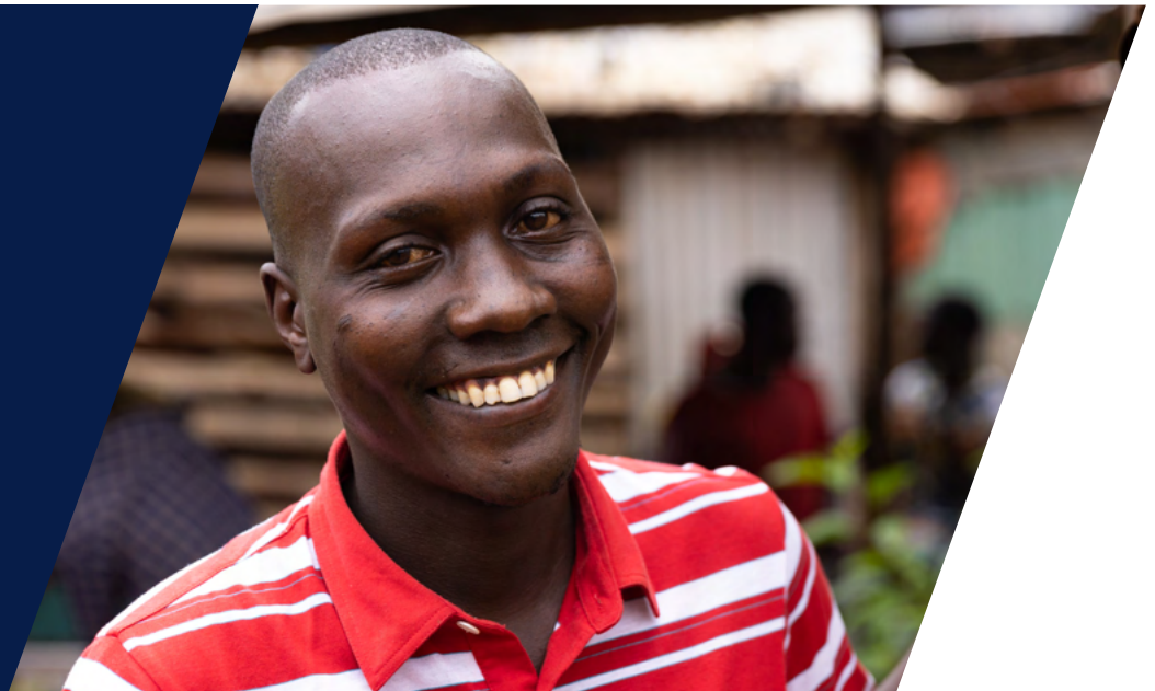
Peer Educator, Teens Link, Uganda