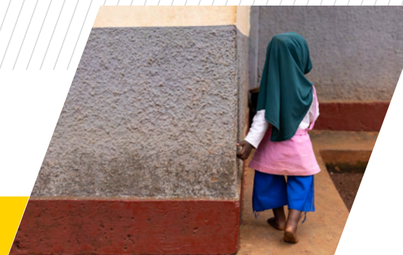
Community client, mothers2mothers, Uganda

Children and young people continue to be a priority population for our funding. Gender disparities mean that adolescent girls and young women are more vulnerable to acquiring HIV than their male counterparts, due to factors including stigma, transactional sex and gender-based violence. Such gender disparities are seen in sub-Saharan Africa with, almost six times as many adolescent girls acquiring HIV compared to boys of the same age in 2021. 1