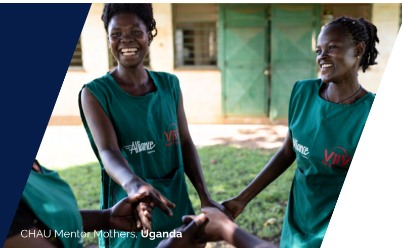
CHAU Mentor Mothers, Uganda

Away from adults, these spaces provided a friendly environment for adolescent girls and their children. They received counselling and support from Mentor Mothers and peer educators, who are openly living with HIV, on raising their self-esteem, taking ART medication as prescribed and continuation with life-saving ART treatment.