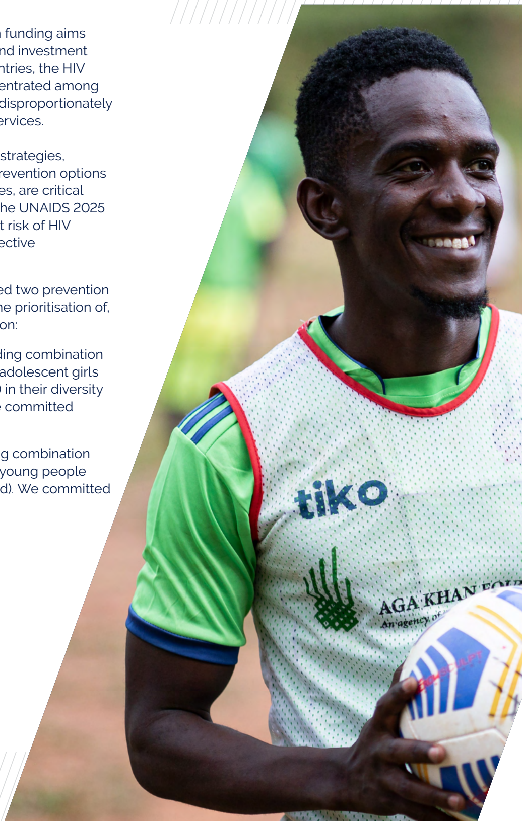
Coach-Counsellor, TackleAfrica, Uganda