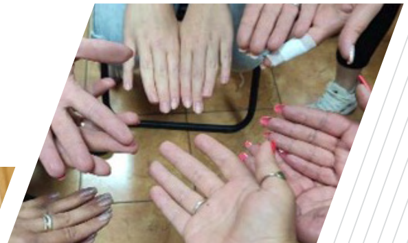
Support group, NGO Club Eney, Ukraine

Overall, 610 women participated in WINGS sessions, led by 19 community leaders who were trained and skilled up on the programme which included GBV screening and automated feedback on their risks as well as safety planning and identifying service needs. Additionally, 201 women were referred to HIV testing, with 158 women receiving tests.