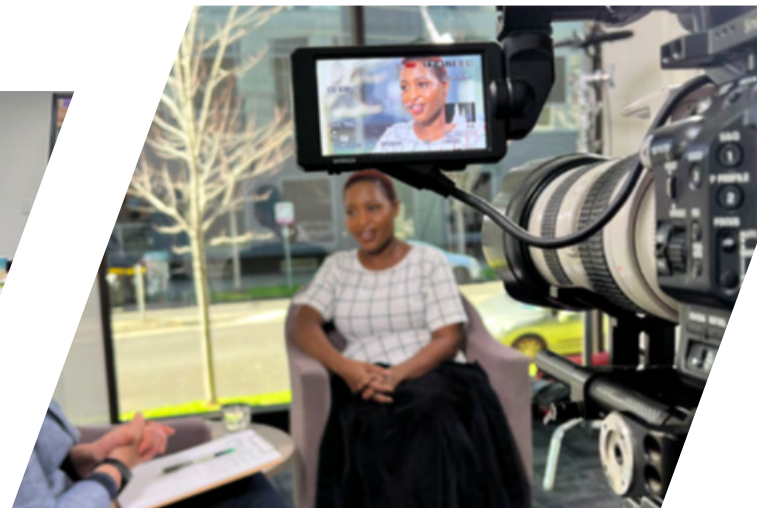
Support workshops, Positive Women Victoria, Australia

As a result of the programme, 100% of women agreed they have increased confidence and better communication skills. The participants also took action to become HIV advocates, with 80% registering to join the Positive Speakers Bureau training programme, run by and tailored for people living with HIV who are trained public speakers and presenters to reduce fear, misinformation, stigma, and discrimination around HIV; 40% have joined or expressed interest in joining the Positive Women Victoria Board. One participant is building a social media platform for 'Stop HIV Stigma', an HIV charity, to raise funds to support orphans living with HIV in Zimbabwe and raise awareness of HIV-related stigma. The social platform will be used to encourage support and recruit volunteers. Another participant is developing a documentary to explore HIV stigma and using social media platforms to reach younger audiences. One participant has used her video interview to disclose her HIV status and another woman plans to use her video interview to help other people living with HIV feel more confident.