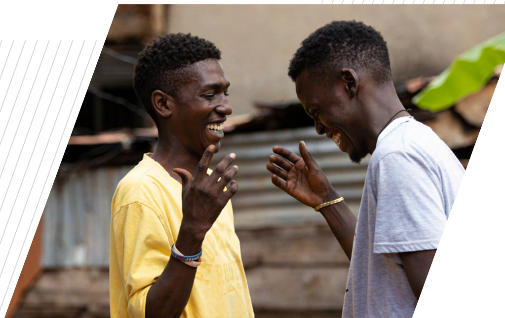
Peer Educators, Teens Link, Uganda