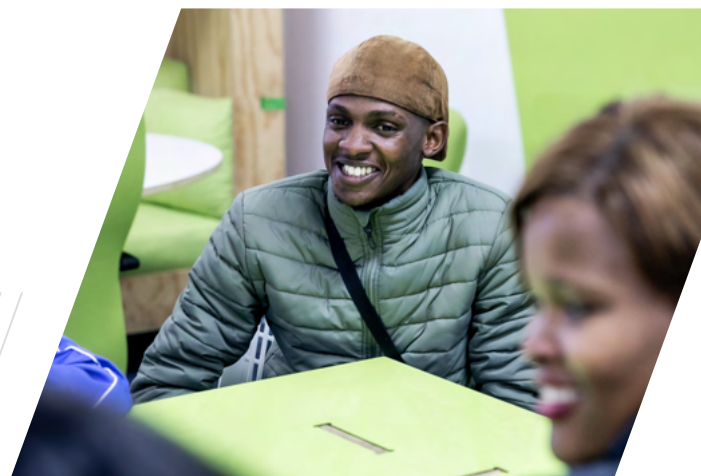
Peer Mentors, One to One, South Africa