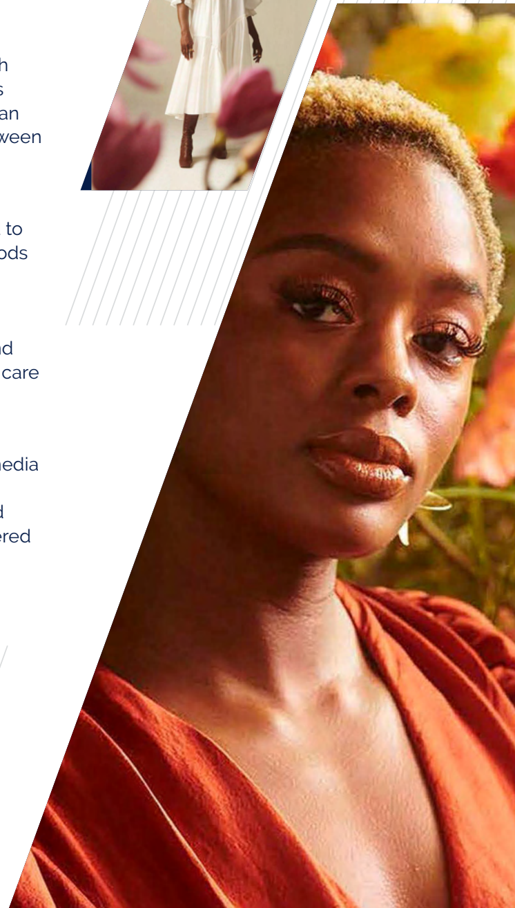
Risk to Reasons project, ViiV Healthcare